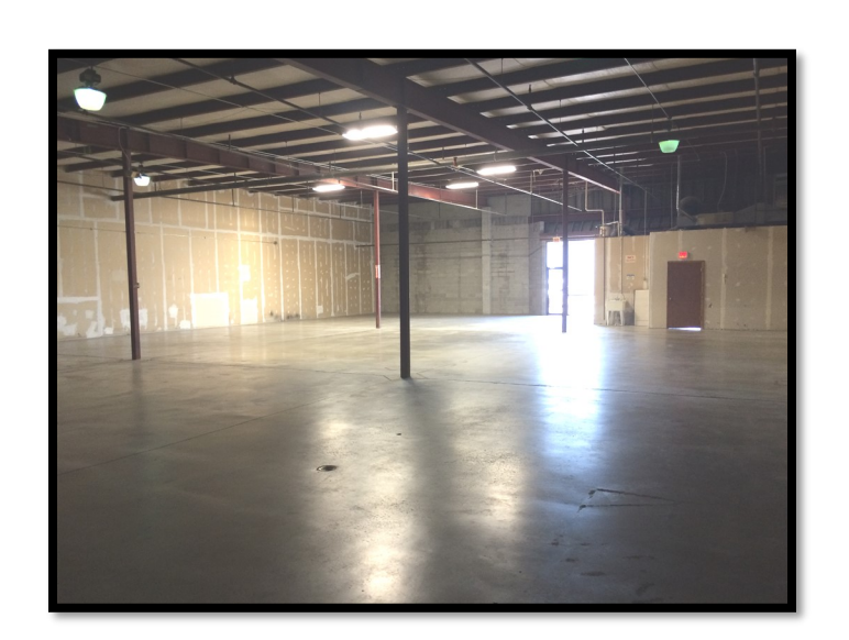
3045 C-D Warehouse (South View)