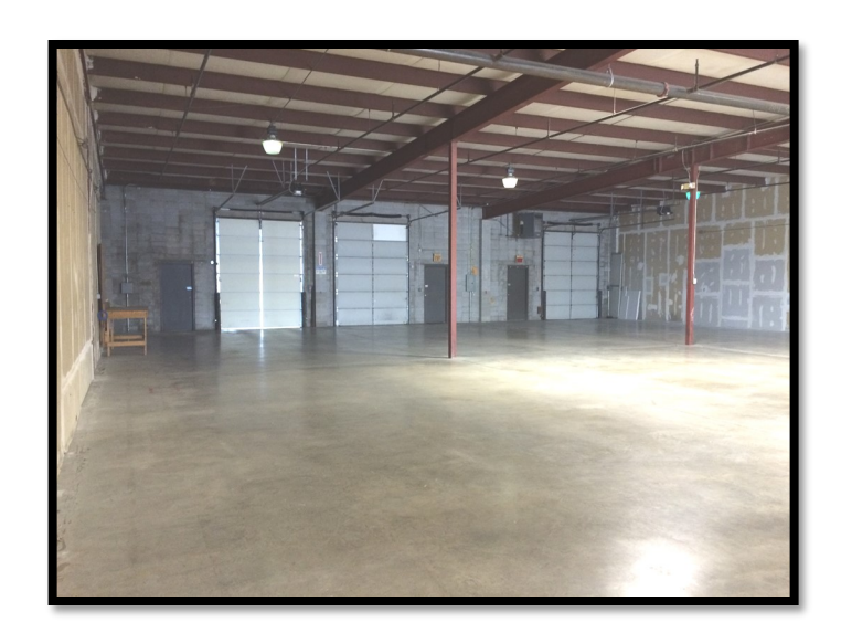
3045 C-D Warehouse (North View)