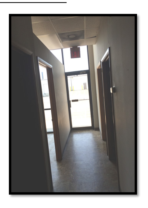
3045 C-D Office Area

FOR ADDITIONAL INFORMATION PLEASE CONTACT